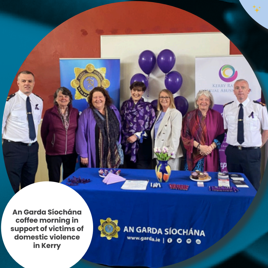
An Garda Síochána coffee morning in support of victims of domestic violence in Kerry