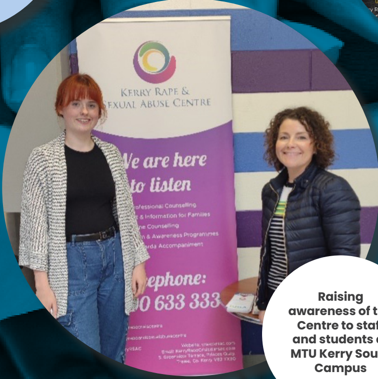
Raising awareness of the Centre to staff and students at MTU Kerry South Campus