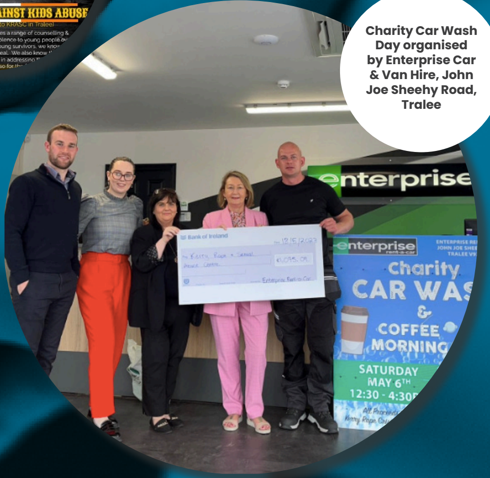
Charity Car Wash Day organised by Enterprise Car & Van Hire, John Joe Sheehy Road, Tralee