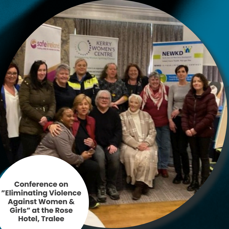
Conference on "Eliminating Violence Against Women & Girls" at the Rose Hotel, Tralee