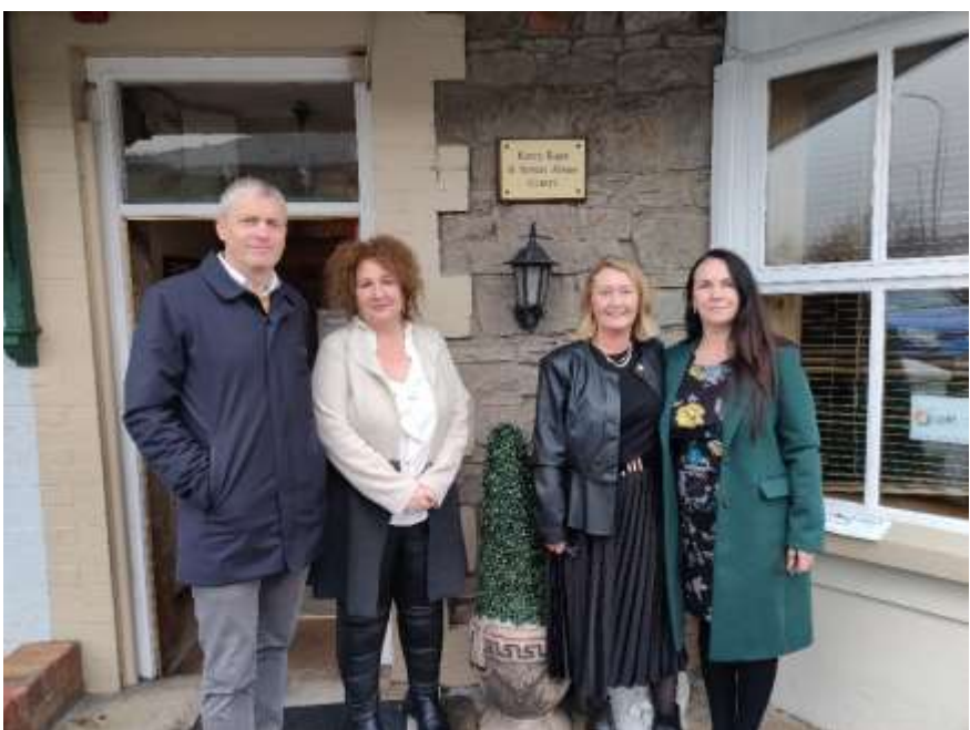
On Monday the 27<sup>th</sup> of November, Kerry Rape & Sexual Abuse Centre hosted and Awareness Session with National Politicians.